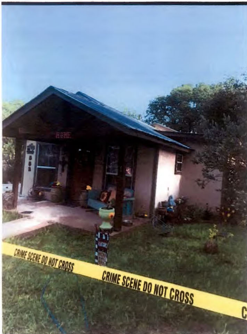
Said suspected place is a single-family residence. The residence has a tan in color exterior, brown trim, two windows facing south, a brown in color front door facing south, and numbers 552 along the left side facing south in addition to the foregoing description, premises and within